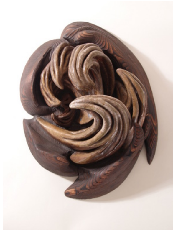
Wayan Rata: "Muddy Water" - Sculpture Ceramic, 2005